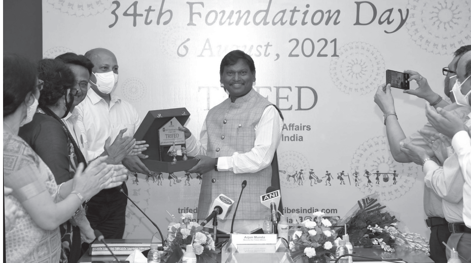
Union Minister for Tribal Affairs, Shri Arjun Munda at the 34th foundation day celebration of TRIFED, in New Delhi

According to market estimates, the demand for Chinese decorative lights and Lord Ganesh's and Goddess Lakshmi's idols has dropped sharply in the recent past during the festival of lights (Diwali) because better quality, cheaper and durable indigenous products are available now.